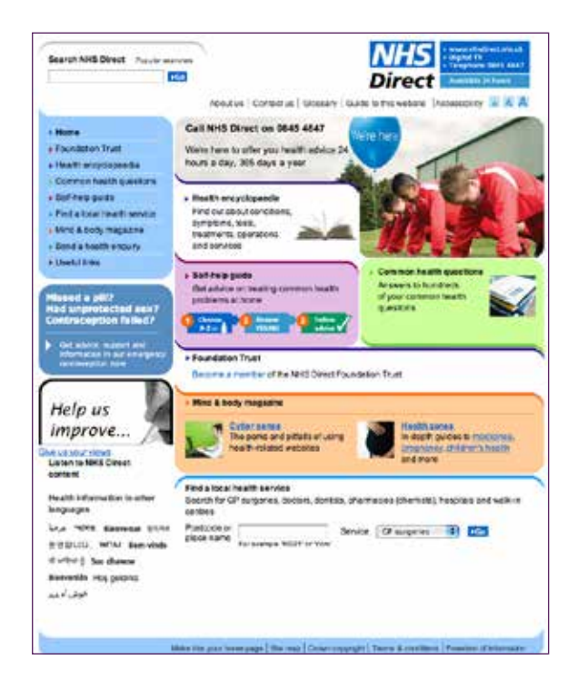
Fig 1 Screen shot of the Homepage, NHS (National Health Service) England: http://www.nhs.uk/Pages/HomePage.aspx

In the meantime, even now a teacher's simple instruction to her class, "start reading", is becoming ever less fitting, more problematic, likely to produce consternation. In many sites it is already vaguely quaint or simply impossible.