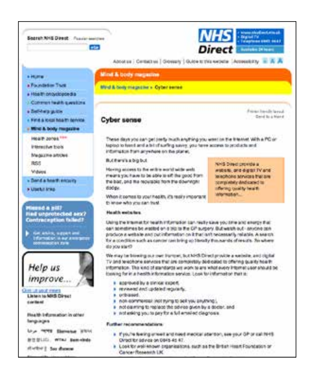
Fig 2 Screen shot of a page in the NHS Website

In its entire interconnection with learning , 'reading' is a hugely significant factor in the formation of